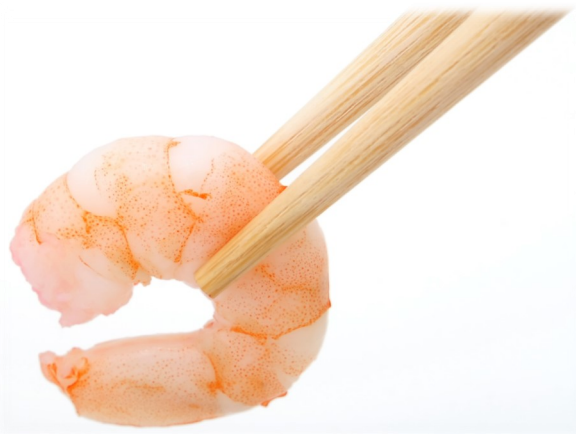
Shrimp & Fish